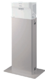
RICOH Projector Stand The RICOH Projector Stand helps you to mount the RICOH PJ WX4152N projector.